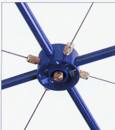
Bottom: Custom colors and finishes